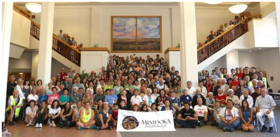
Minidoka Pilgrimage 2016