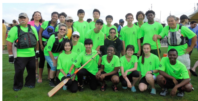
Dragon Boat Races